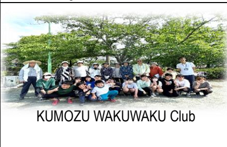
KUMOZU WAKUWAKU Club