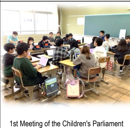
1st Meeting of the Children's Parliament