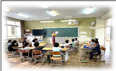
Library volunteers reading to the lower grades