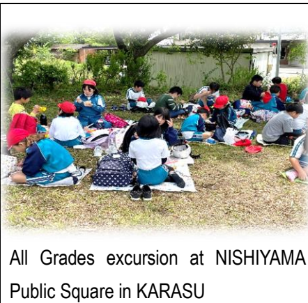
All Grades excursion at NISHIYAMA Public Square in KARASU