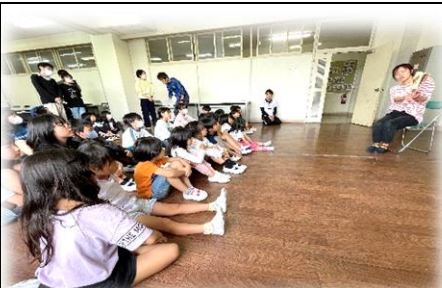
Library volunteers reading to all students at school