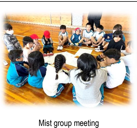
Mist group meeting

We are posting on HP from KUMOZU SHOUGAKKOU→