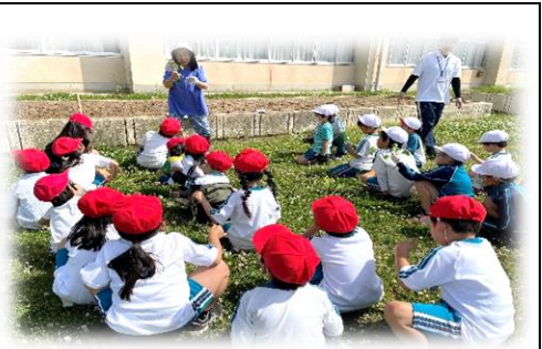
Planting the sweet potato vine.