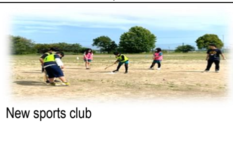
New sports club