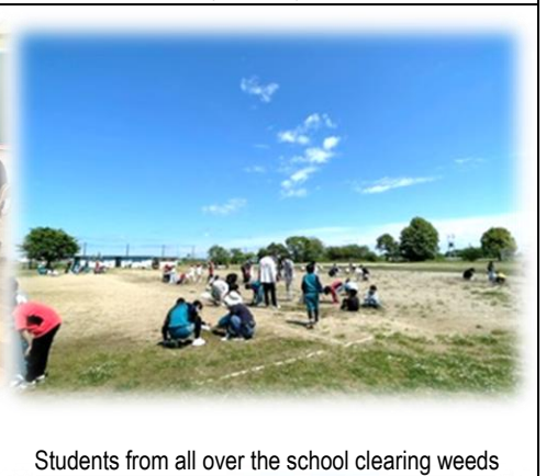
Students from all over the school clearing weeds