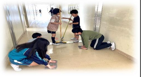
Mixed group cleaning