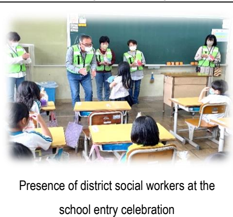
Presence of district social workers at the school entry celebration

The tea served to refresh the throats of the children who played hard in the afternoon. Thank you very much