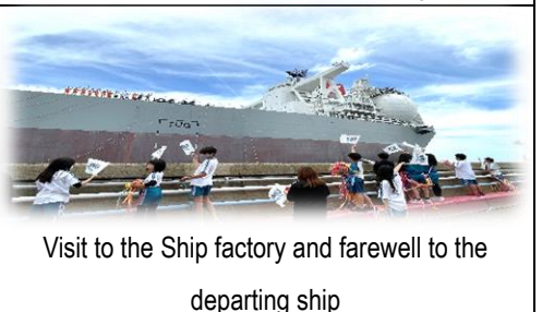
Visit to the Ship factory and farewell to the departing ship