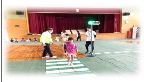
Traffic safety class

(PTA security and publishing department)