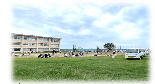
The race track and field were cleared.

And always lends their kind hand and strength, I will continue to manage the school with great gratitude on a daily basis. On Saturday, October 26th, we will hold the UNDOKAI (in case it rains, it will be postponed to Saturday, the 27th). With the decrease in students, this year we will hold the UNDOKAI dividing the students into groups of 1st, 2nd and 3rd grades and 4th, 5th and 6th grades. In addition, to fully utilize the mixed grade group, in activities in which the entire school will participate, such as the opening and closing ceremonies and the cheering tents, we will hold with the mixed grade group, to deepen the relationship between the students from 1st to 6th grades. I would be very happy if the family and people from the community came to witness the great performance of the children.