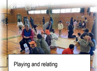
Playing and relating

Hosted by the Kumozu District Social Welfare Council on 12/7(Sat)