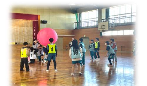
News Sports Club