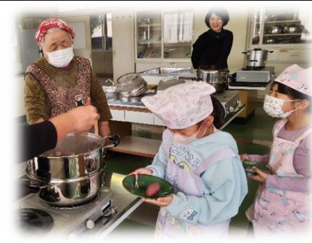
1st and 2nd grades steaming the harvested potatoes