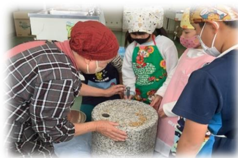
3rd graders making KINAKO with the soybeans they harvested