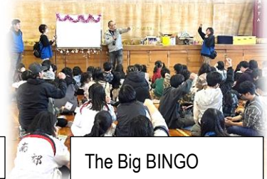
The Big BINGO