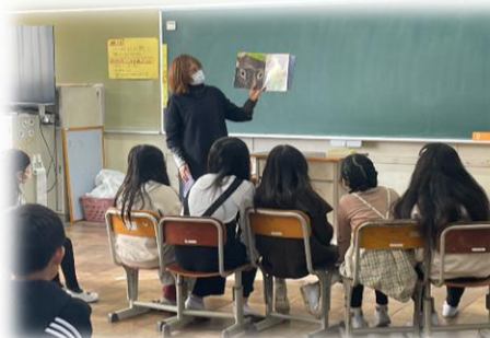
Book reading by volunteers