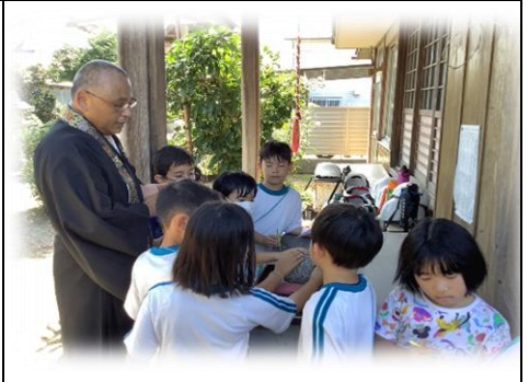
2nd Grade Town Exploration