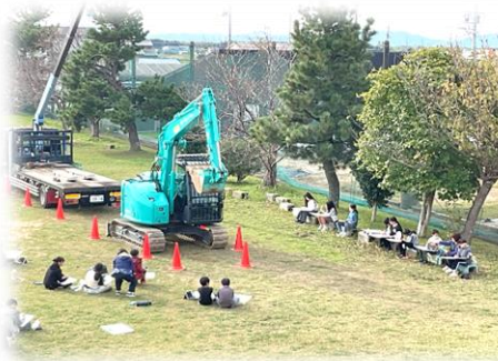
5th grade drawing the sketch