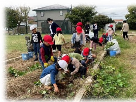
Sweet potetos harvest by 1st and 2nd grades

I believe that by spending the days satisfactorily together with colleagues, having several encounters with people and through various experiences, they learned to feel pleasure in relating to people and to look at themselves. By receiving several opportunities to learn together with people from companies, people from the Kumozu community and together with parents, we were able to connect all of this to early childhood education. Thank you very much. I am presenting a part of the events below: