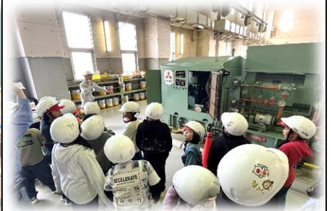
4th Grade Visit to Purification Center