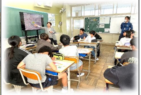
6th Grade working to make their dream come true