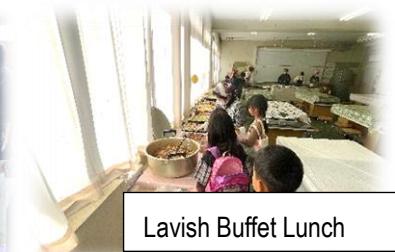
Lavish Buffet Lunch