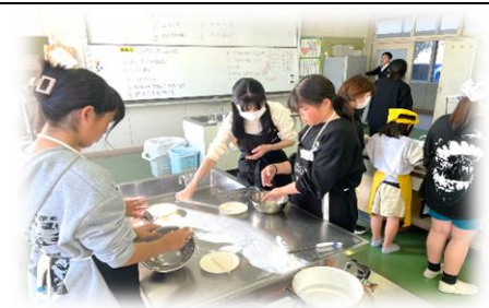
KUMOZU WAKUWAKU Club